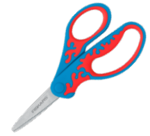
1 pair of scissors