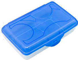
1 Pencil Box Or bag