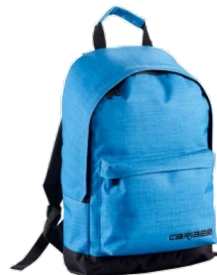
1 backpack with a Change of clothes Labeled In a Ziploc bag