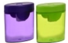
Pencil sharpener With lid