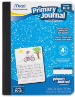
1 Composition/spiral Notebook

Please provide the following supplies to be used at school.